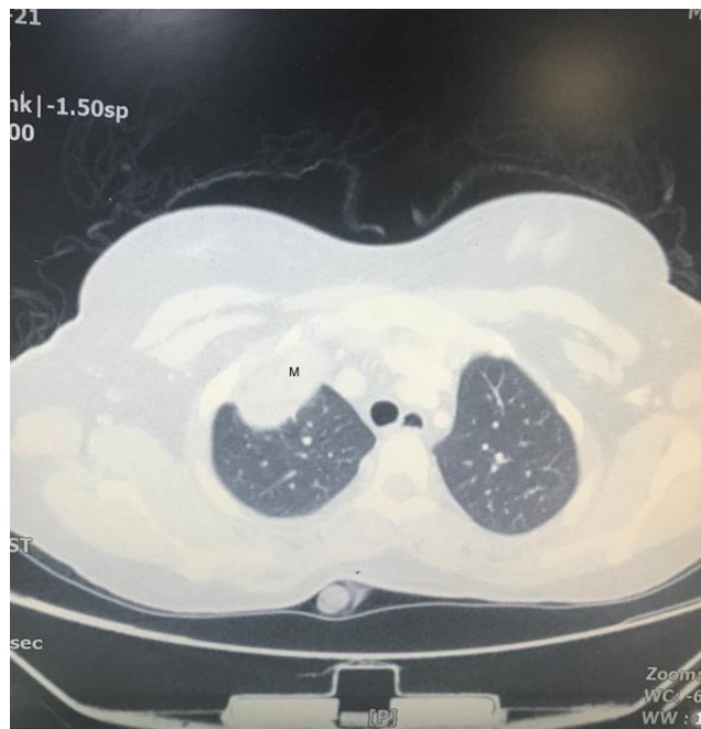
FIGURE 1 Axial view of CT scan with contrast, showing a huge enhanced mass in the right anterior mediastinum (M represents mass).

was performed resulting in perfect resection of the mediastinal mass. Up on histopathologic examination, the cyst contained cells derived from multiple origins that were well-matured and differentiated indicating a mature cystic teratoma. The pathologic feature was consistent with a cystic neoplasm with calcification of the wall, composed of intestinal tissue, cartilaginous tissue, stratified squamous epithelium, keratinous material, skin, sebaceous glands, and adnexal structures. Also, the endocervical lining, mature seromucous glands, and pancreatic and thymic tissues were present. Inflammatory reactions, foreign body granuloma, foamy macrophage infiltration, and fat necrosis were noted, too (Figure 2).